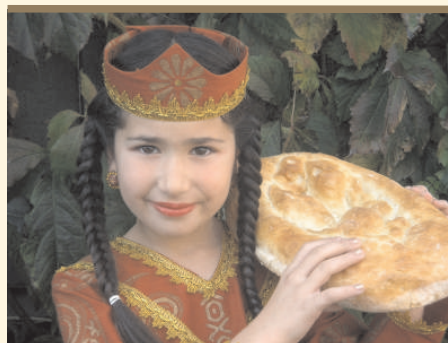
Girl in traditional dress with bread

Sightseeing - Dilijan town, Haghartsin, Sanahin and Haghpat churches built in the 12th and 13th centuries; Dsegh village, museum of famous poet Hovhanness Toumanyant; botanical garden; and Gyumri, the second biggest city in Armenia.