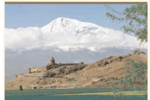
Khor Virap Monastery

Sightseeing - Jermuk resort town famous for hot mineral water; Khor Virap Monastery; Noravank monastery built in the 13th century; Tatev monastery, started in 848 AD; and Karahunch, the Armenian Stonehenge.