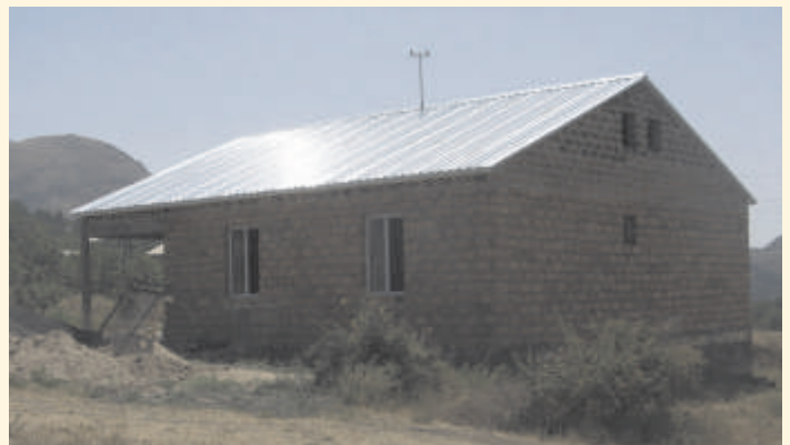
A completed house