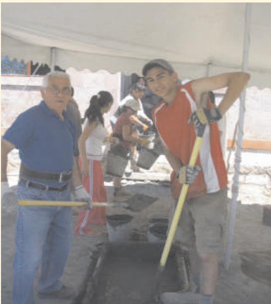
Volunteers at the site

You get to accomplish something truly wonderful, changing the world into a better place, experiencing another culture, acquiring lifelong friends and truly making a difference. In some cases, you may be able to practice a foreign language, or study firsthand innovative, low-cost and durable building techniques utilized by other nations. You will have an opportunity to build something with your own hands, and to transform the life of a family by turning love into action.