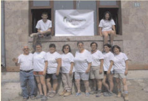
Global Builders team in Khor Virap village

Traveling to Armenia is possible via international flights and FCHA staff will assist you to get to your accommodation site. The current building projects include completion of half-built houses and renovation of deteriorated houses.